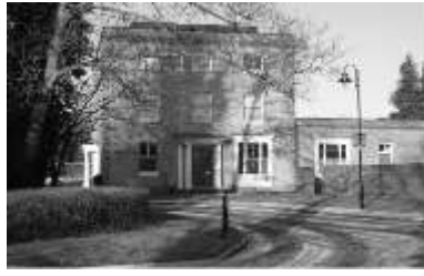
Purbrook House, Purbrook Gardens Grade II Listed Building