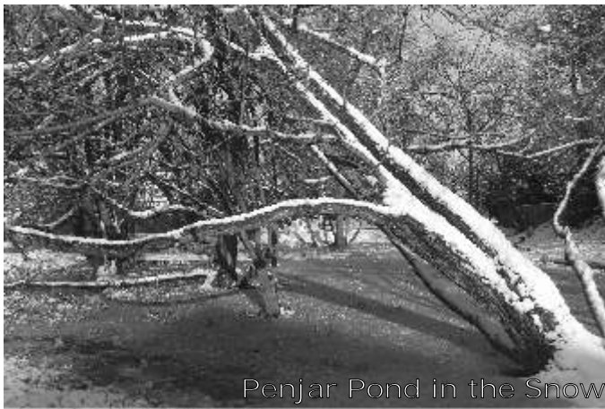
Penjar Pond in the Snow