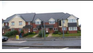
On the A3 at Cowplain