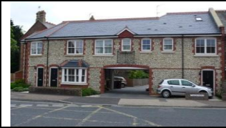
Chichester, near station

Here's what has been achieved locally on similar sites.